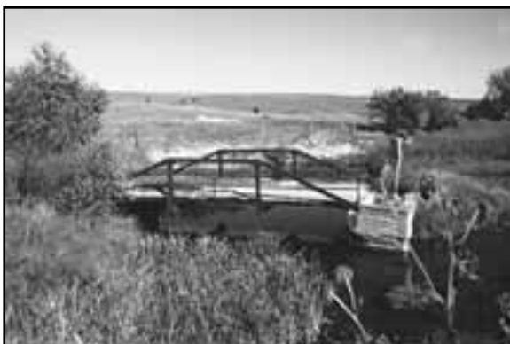
Pin-connected Pratt pony truss bridge located near Champion, CH00-055