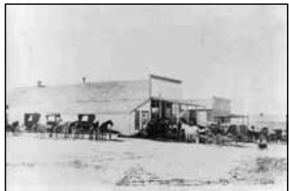
General store in Lamar, 1909 (CHM)

The original town site of Enders was platted in 1890 also by the Lincoln Land Company and named for a local rancher named Peter Enders. In 1908 residents moved 2 miles east to be closer to the Frenchman Creek and the site of the town shifted. Little is recorded in Enders during the middle of the twentieth century in local history. By 1950, Enders reached a peak population of 100 residents. The following year, the United States Bureau of Reclamation constructed the Enders Dam and Reservoir near Enders to irrigate farmland in Chase County. The population of Enders is not more than a few dozen people today, but the community is host to many outdoor enthusiasts every year who use the reservoir for recreational purposes. 21