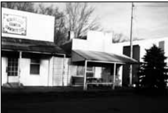
Commercial building located at east side of Main Street between Broadway and 2nd Streets in Champion, CH01-014