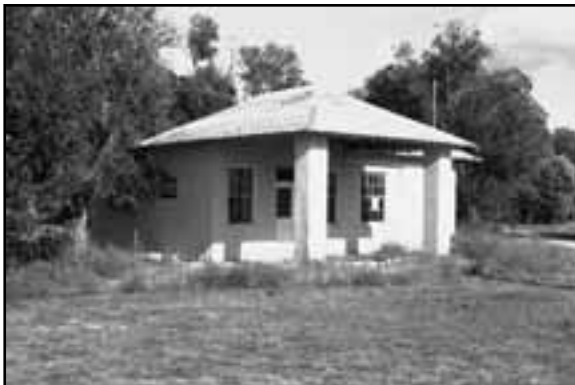
Gas station located in Lamar, CH05-003