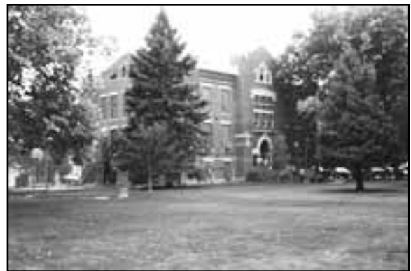
Chase County Courthouse located in Imperial, CH04-007, listed in the National Register

The historic context of government pertains to properties that relate to the act or process of governing at the federal, state, or local level. The Chase County Courthouse (CH04-007), listed in the National Register, in Imperial and Post Office building (CH01-015) located in Champion are examples of government related properties.