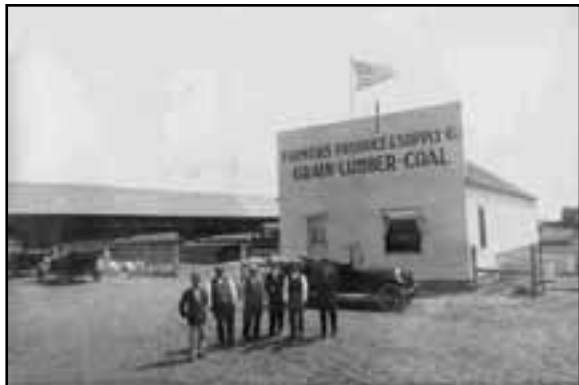
Farmers Produce and Supply Company in Enders, 1912 (CHM)

and larger projects, such as the Enders Dam and Reservoir constructed in the 1950s, remain visible on the landscape.