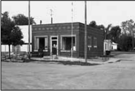
Champion Post Office, CH01-015