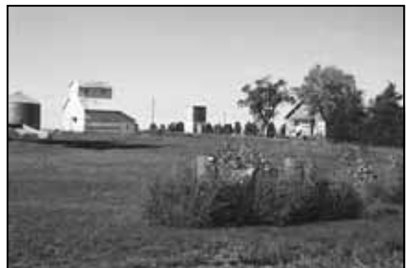
Farmstead located near Wauneta, CH00-069

Many of the ranches in Chase County are located a considerable distance from the public right-of-way which precluded the evaluation of these resources and their inclusion in the survey.