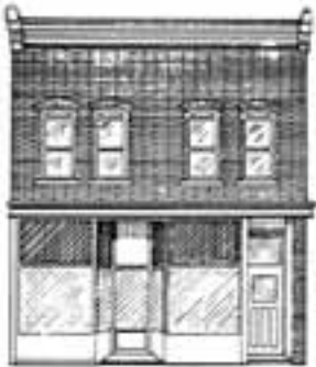
Example of Commercial Vernacular Style

Commercial Vernacular Style (circa 1860-1930). A form of building used to describe simply designed commercial buildings of the late nineteenth and early twentieth centuries, which usually display large retail windows and recessed entrances on the first floor.