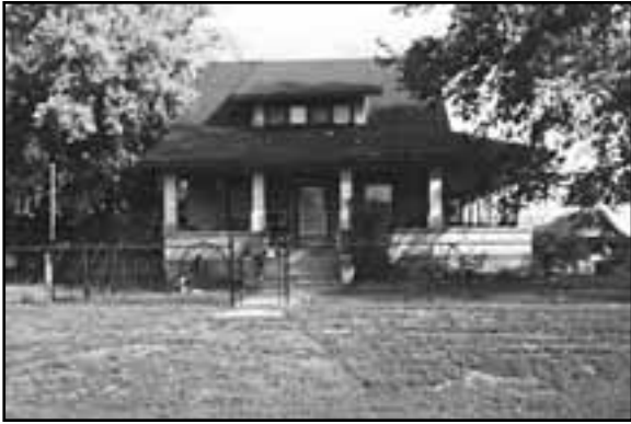
Example of Bungalow in Champion, CH01-007