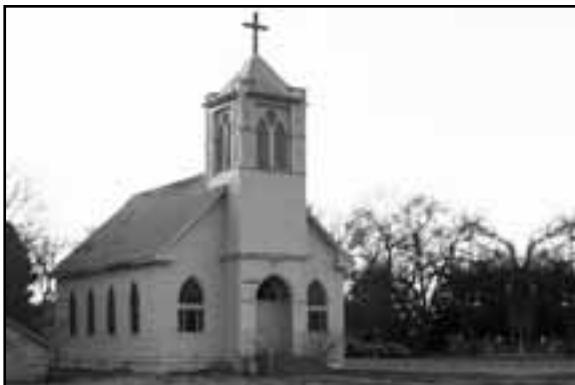
St. Michaels and All Angels Episcopal Church located on Wellington Street between 10th and 11th Streets in Imperial, CH04-006. This church is significant under

Criterion C: Architecture, applying Criterion Consideration A for religious property owned by a religious institution and applying Criterion Consideration B for a moved property.