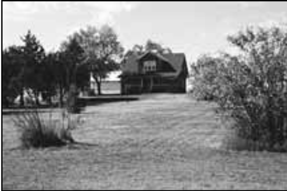
Farmstead located near Wauneta, CH00-069