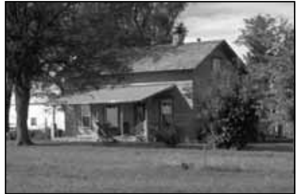
Rural homestead near Champion, CH00-039

This church is significant under Criterion C: Architecture, applying Criterion Consideration A for religious property owned by a religious institution.