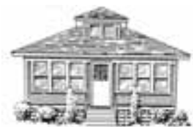
Example of One-story Cube building form

Noncontributing (National Register definition). A building, site, structure, or object that does not add to the historic architectural qualities or historic associations for which a property is significant. The resource was not present during the period of significance; does not relate to the documented