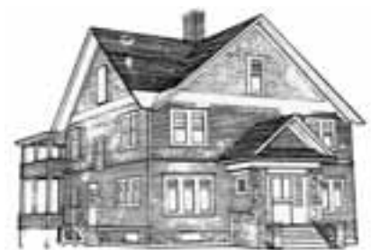
Example of Cross gable building form

False-front (circa 1850-1880). A vernacular building form, which is typically a one-and-one-half story front gable frame building with a square facade that extends vertically in front of the front-facing gable. This gives an entering visitor the sense of approaching a larger building. This form is often used in the construction of a first-generation commercial building, thus is also known as “boom-town.”