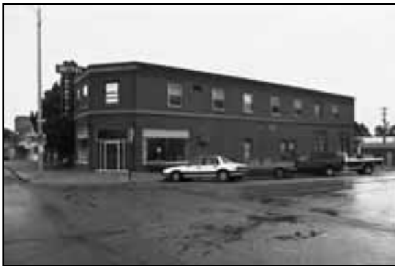
Imperial Hotel in Imperial, CH04-047

Commercial properties also include resources associated with the selling and trading of cattle and other agricultural products, such as stockyards, corrals, and grain elevators. The Texas Trail helped to make cattle ranching and trading an important historical theme in Chase County. Consequently, several cattle trading related resources are associated with the context of Commerce. However, due to the ephemeral nature of resources associated with early cattle drives and trading, few extant resources remain on the landscape.