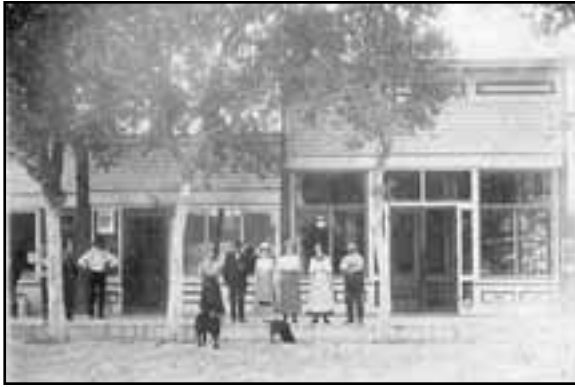
Commercial building in Wauneta, c. 1900 (CHM)