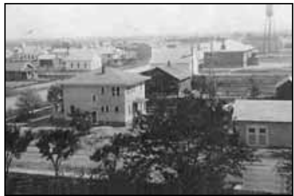
Birdseye view of Imperial, c. 1905 (CHM)

train's steam engine. Initially, the stops consisted of water tanks and places for the construction crews to live while building and maintaining adjacent sections of the railway. Gradually the stops also served as shipping and receiving points for area settlers. Over time, railroad developers platted town sites, constructed depots, and built houses for section foremen. Communities developed to serve the surrounding farmers, who in turn further increased the use of the railroad for transportation of goods to markets in the East. 5