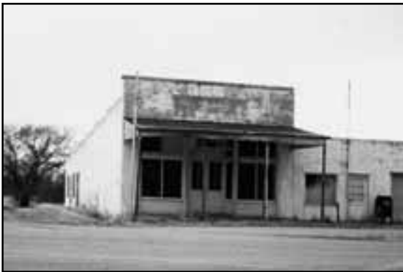
Commercial building located at northwest corner of Pawnee and Arapahoe in Lamar, CH05-002