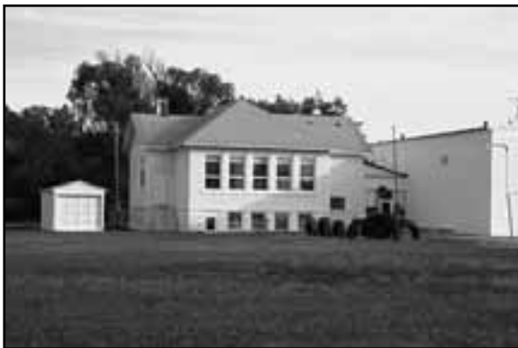
Public school located in Champion, CH01-009

The education context relates to the processes of teaching and learning. The reconnaissance survey identified public schools as related property types. Schools were typically one story in height and of frame or brick construction. Rural schools were simple frame buildings with gable roofs with few architectural details. Examples of educational buildings documented during the survey include the Chase Public School building (CH01-009) located at the southeast corner of Broadway and Mill Streets in Champion and a rural schoolhouse (CH00-052) located near Champion.