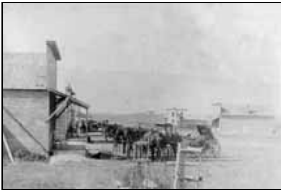
Main Street in Champion, 1896