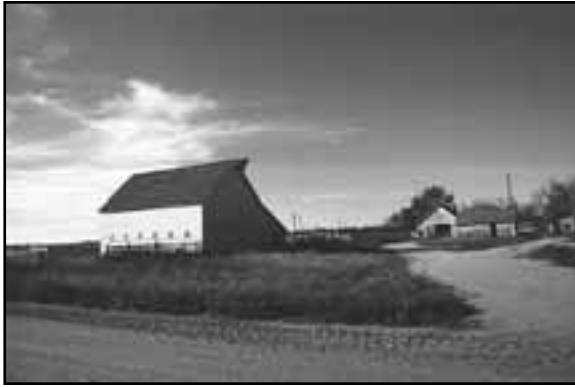
Farmstead located near Champion, CH00-057