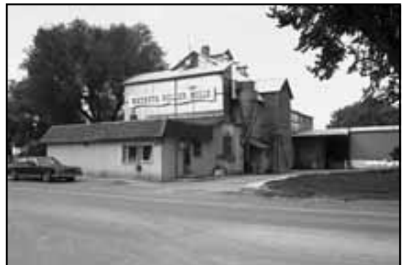
Wauneta Roller Mills located along Arapahoe Street in Wauneta, CH06-013