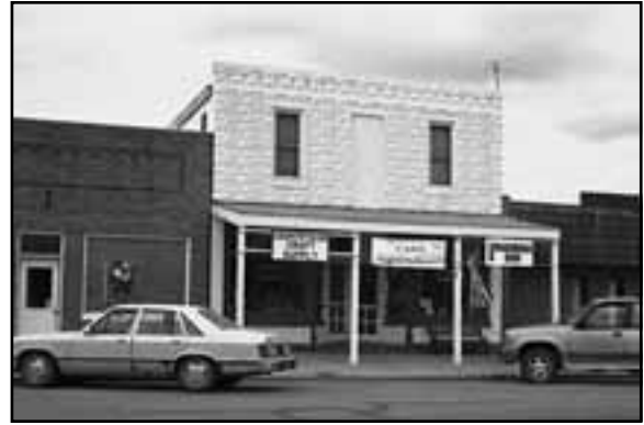
Commercial building located at 427 Broadway Street in Imperial, CH04-018