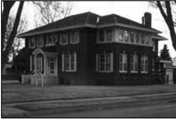
House located at 841 Court Street in Imperial, CH04-013