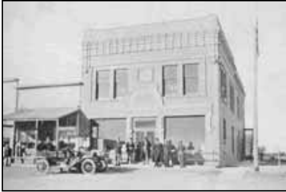
First National Bank in Imperial, c. 1915 (CHM)

Historic Places) was built between 1910 and 1912 at the same location at the corner of Ninth Street and Broadway. 17