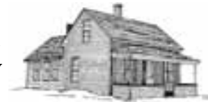
Example of Side gable building form

Pony truss bridge (circa 1880-1920). A low iron or steel truss, approximately 5 to 7 feet in height, located alongside and above the roadway surface. Pony truss bridges often range in span lengths of 20 to 100 feet.