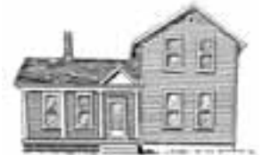
Example of Gabled Ell building form

Gabled ell (circa 1860-1910). The vernacular form of a building, generally a house, in which two gabled wings are perpendicular to one another in order to form an "L"-shaped plan.