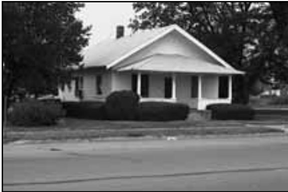
Example of front gable house located in Imperial, CH04-041

An example of a side gable house in the survey is the house (CH06-037) on the corner of Pontiac and Wichita Streets in Wauneta.