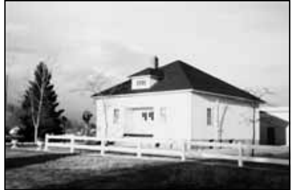
Schoolhouse located at the corner of Chase and Broadway Streets, CH01-008. Presently the Chase County Historical Museum.