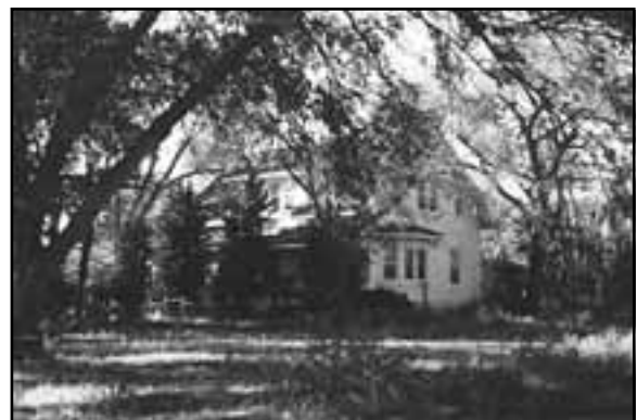
Farmstead located near Champion, CH00-057