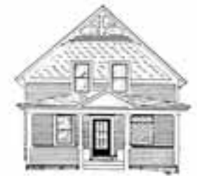
Example of Front gable building form

High Victorian Gothic (circa 1865-1900). This architectural style drew upon varied European medieval sources and employed pointed arches and polychromatic details. The heavier detailing and more complex massing made this style popular for public and institutional buildings.