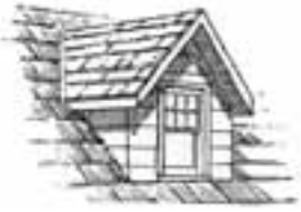
Example of Dormer

Feeling. Quality of integrity through which a historic property evokes the aesthetic or historic sense of past time and place.