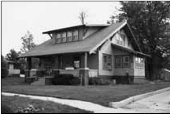
Example of Bungalow in Wauneta, CH06-009

•Queen Anne houses date from the late nineteenth and early twentieth centuries and display frame construction with irregular form. Details including decorative shingle work, porches with scroll work and spindles, turrets, and a variety of wall materials. An example of a Queen Anne style house is found in Wauneta at the corner of Wichita and Arikare Streets (CH06-004).