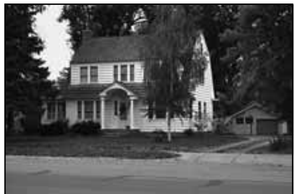
Example of Dutch Colonial Revival house located in Imperial, CH04-039

•Other Period Revival styles include Dutch Colonial Revival and Colonial Revival. All of these styles were popular during the early decades of the twentieth century and reflect a variety of characteristics associated with the period revival movement. Examples include a Georgian Revival style house on Court Street in Imperial (CH04-013, see Chapter 4. Recommendations for photograph of this property) and Dutch Colonial Revival house on Broadway Street in Imperial (CH04-039).