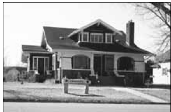
Bungalow located at 252 Arikare Street in Wauneta, CH06-003

Criterion C: Architecture, applying Criterion Consideration A for religious property owned by a religious institution and applying Criterion Consideration B for a moved property.