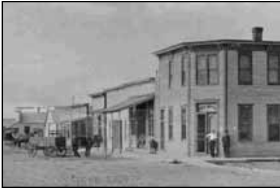
View of Main Street looking north in Imperial, c. 1910