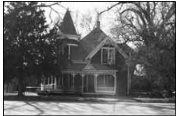
James Burham House located at 422 Arapahoe Street in Wauneta, CH06-014