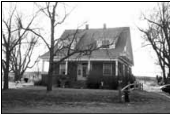
George Getzendaner House located near Champion, CH00-019