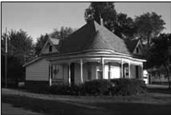
Example of Queen Anne house located in Wauneta, CH06-004

•Queen Anne houses date from the late nineteenth and early twentieth centuries and display frame construction with irregular form. Details including decorative shingle work, porches with scroll work and spindles, turrets, and a variety of wall materials. An example of a Queen Anne style house is found in Wauneta at the corner of Wichita and Arikare Streets (CH06-004).