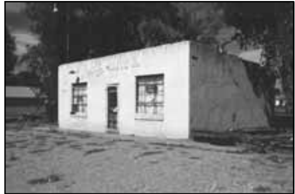
Jack's Drive-In located in Wauneta along the DLD Highway route, CH06-048

During 2001-2002 NeSHPO conducted a survey of Nebraska's historic highways, including the DLD in Chase County. For information on the history of highway development or properties surveyed along the DLD, contact the NSHS.