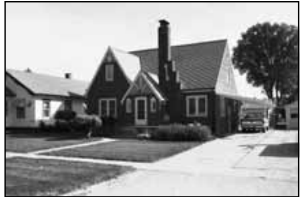
Example of Tudor Revival house located in Wauneta, CH06-040

•Tudor Revival characteristics, dating from the latter-half of the mid-twentieth century, include half-timbering, multi-gabled rooflines, decorative chimneys, and large window expanses subdivided by a multitude of mullions. Residential buildings typically display balloon frame construction with stucco or brick veneer. The house in Wauneta located on Shawnee Street (CH06-040) is an example of the Tudor Revival style.