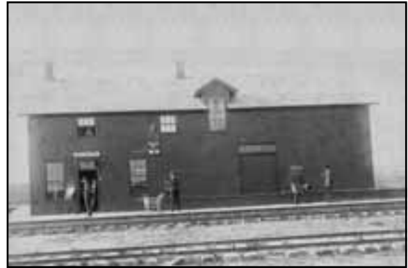
Wauneta's train station, c. 1890 (CHM)

German, and Spanish immigrants located in Wauneta, many opening businesses. By the early 1890s, there were two banks, a school, a church, and a host of stores including three general stores, a hardware store, and a drug store. By 1900, the population of Wauneta reached 181 residents. 12