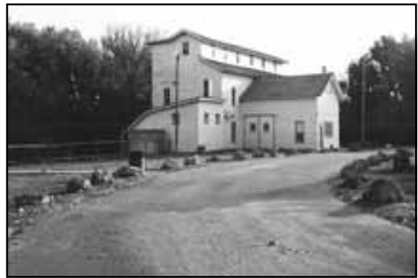
Champion Mill located in Champion, CH01-001, listed in the National Register

The historic context includes industries that processes, prepares, or packages of goods and products. Associated property types include mills, stockyards, creameries, lumber yards, and brick yards. In Chase County the Champion Mill (CH01-001, listed in the National Register) and the Wauneta Roller Mills (CH06-013) in Wauneta are examples of properties surveyed associated with the processing industry context.