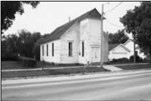
Church located in Wauneta, CH06-032

The historic context of religion relates to the institutionalized belief in, and practices of, faith. Related property types identified during the reconnaissance survey include churches, cemeteries, and clergy residences. The churches identified in the survey were typically of frame or brick construction and demonstrate elements of the Neo-Gothic style or were vernacular in form.