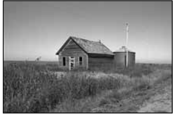
Rural schoolhouse located near Champion, CH00-052