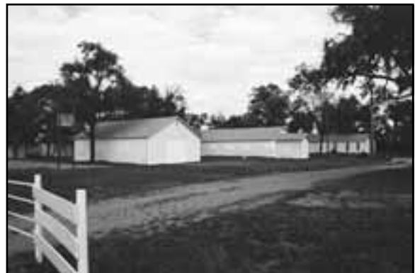
Imperial Valley Holiness Camp located near Imperial, CH00-040. Applying Criterion Exception B for a moved property and Criterion Consideration A for a property owned by a religious institution. The complex should be considered under Criterion C: Architecture as a Religious Complex and under Criterion A: History for its association with the Enders Dam and Reservoir project, from which it was moved during the 1940s.