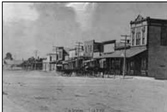
Main Street in Imperial, 1910 (CHM)

machinery such as the steel plow, which could slice through the heavy soil of the plains; and the twine-binder, which gathered bundles of wheat and tied them with string. Agricultural improvements also included new varieties of grain, such as drought-resistant sorghum, that contributed by increasing harvests. Barbed wire, patented in 1874, enabled farmers to protect their property from roaming livestock. Improvements in transportation and engineering enabled railroads to connect southwestern Nebraska to major cities in the East, making it easier to ship produce to market. Historically, the agricultural products of Chase County consisted of grains – principally wheat and sorghum – hay and ranching. 3