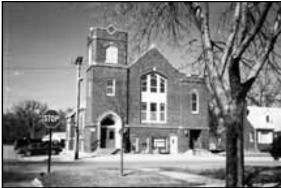
First Methodist Episcopal Church located at corner of Shawnee and Wichita Streets in Wauneta, CH06-016.

This church is significant under Criterion C: Architecture, applying Criterion Consideration A for religious property owned by a religious institution.