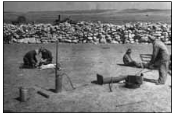
Ranching activities at the Texas Trail Stone Corral near Imperial, c. 1920, CH00-041

Examples of commercial properties include the Imperial Hotel (CH04-047) located at the corner of Broadway and D Streets in Imperial, and the commercial building (CH04-018) located at 427 Broadway Street in Imperial.