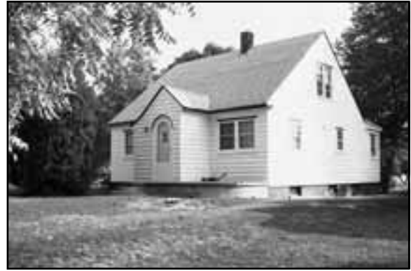
Example of side gable house located in Wauneta, CH06-037

Examples of front and side gable houses were found throughout the survey area functioning as farmhouses and residences in communities. These houses commonly have a symmetrical fenestration pattern and have modest architectural details. Most commonly displayed details include side bay windows and dormers. Together, these forms represent much of the rural housing constructed by the ranch and farming community during the late nineteenth and early twentieth centuries.