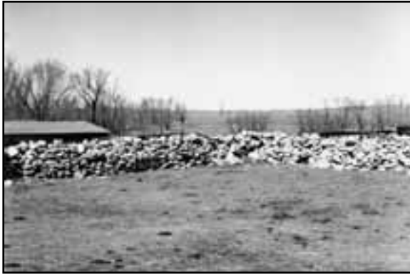
A portion of the Texas Trail Stone Corral near Imperial, c. 1920, CH00-041